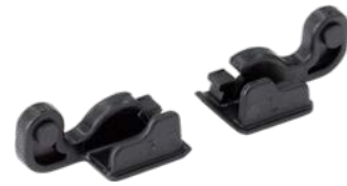
9980.012 Swing latch for lid BL

No. per pack: 30 pcs 2 hinges / 2 latches