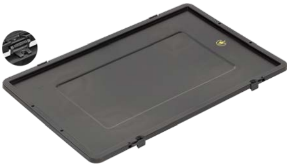
6400.032 Hinged lid BL