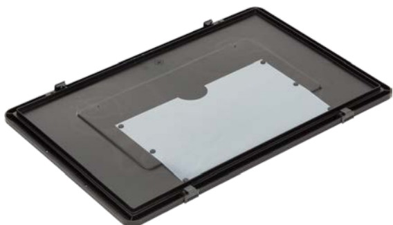
6400.932 Hinged lid BL