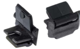
9980.011 Hinge for lid BL

No. per pack: 40 pcs for loosely laying on