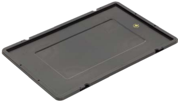
6400.000 Loose lid BL