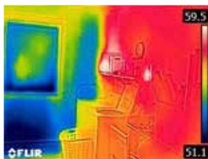
Uninsulated outside wall