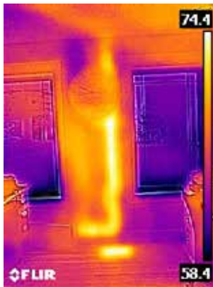
Warm drain pipe in wall