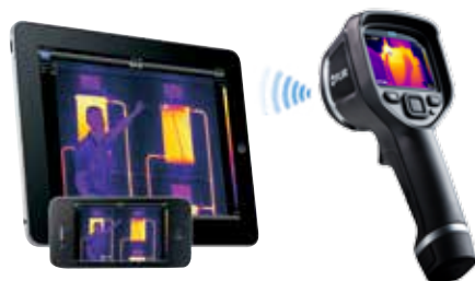
Wireless Connectivity to Smartphones, Tablets and more.