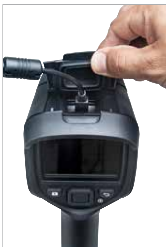
Download images fast via USB

Specifications are subject to change without notice. For the most up-to-date specifications, go to www.flir.com