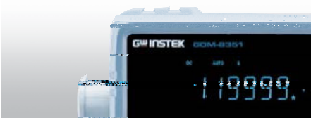
Displayed digits will not be decreased because of selecting different speeds