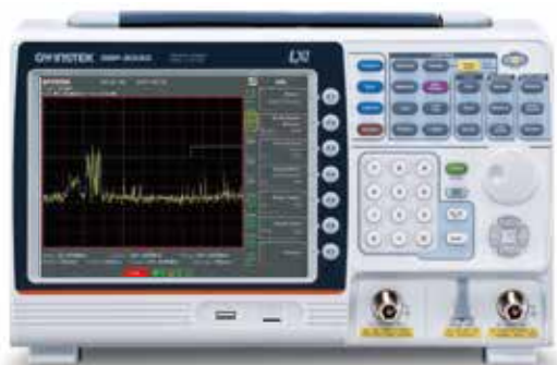
GSP-9330 with Tracking Generator