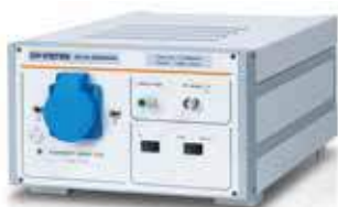
Two-Line V-Network(LISN): GLN-5040A