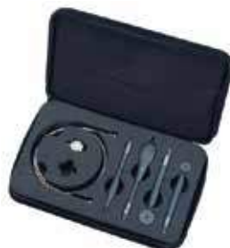
EMI probe set: GKT-008