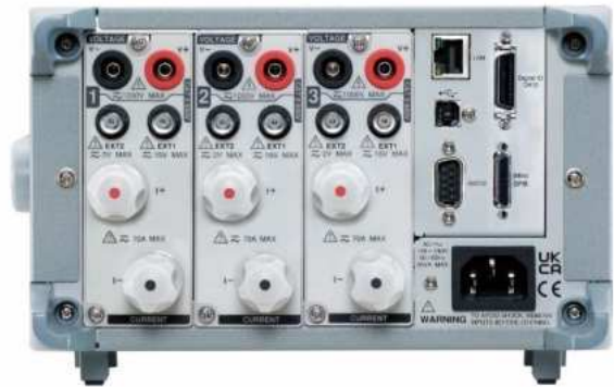
GPM-8330-60 with opt. GPM-DA12