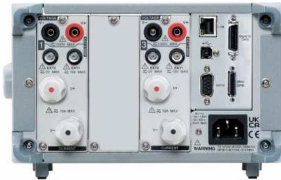
GPM-8320-60 with opt. GPM-DA12