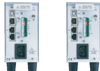
PFR-100L Rear Panel PFR-100M Rear Panel