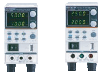
PFR-100L Front Panel PFR-100M Front Panel

The PFR-100 series provides special functionalities to meet test requirements for different load's characteristics. The CC priority mode can be applied for DUTs with diode characteristics to prevent DUT from being damaged by inrush current. A slow rise time for voltage can also protect DUT from inrush current, especially for tests on capacitive load. When power is off or load is disconnected, the activation of Bleeder circuit control will allow the bleeder resistor to consume filter capacitor's electricity. Without the bleed resistor, power supply's filter capacitor may still have electricity that is a potential hazard. For automatic testing equipment systems, the bleeder resistor allows PFR-100 series to rapidly discharge to prepare itself for the next operation.