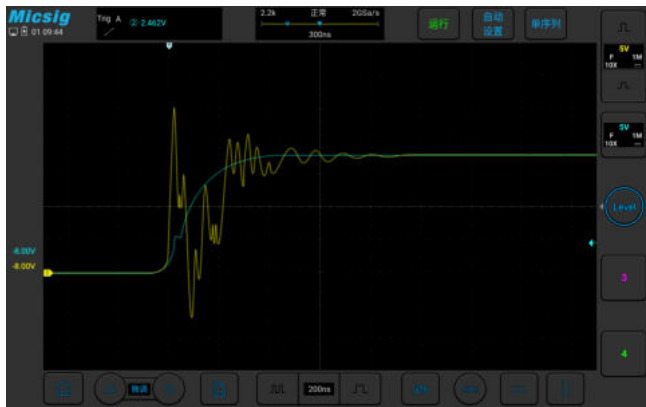
■ Differential Probe ■ SigOFIT Probe