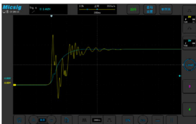
▲ Vgs signal at SiC conduction moment