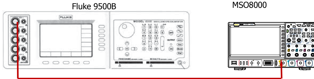
Figure 2-1 Impedance Test Connection Diagram