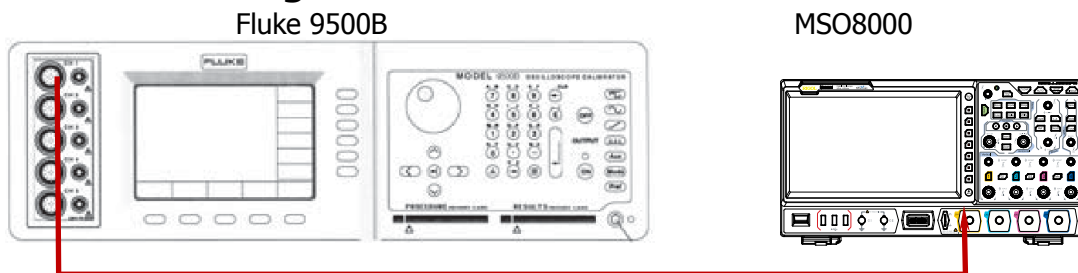
Figure 2-5 Timebase Accuracy Test Connection Diagram