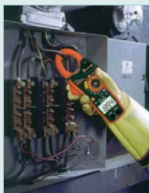
CAT IV -600V safety rating for added protection and True RMS feature gives you accurate readings of non-sinusoidal waveforms.