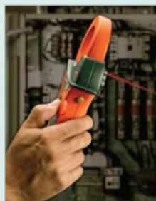
Built-in IR Thermometer with laser pointer is an excellent troubleshooter for locating hot spots and overheating motors.