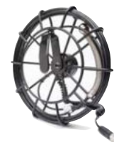
Camera probes with cable length greater than 3m will be coiled on a spool as shown on the left.