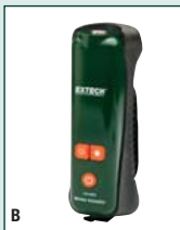
A. Articulating (6mm diameter) camera tip adjusts up to 240° viewing angle with four built-in bright LED lights illuminate dark areas B. HDV-WTX — Optional Wireless Transmitter transmits video to the main display from tight or hard to reach places up to 100ft (30m) away