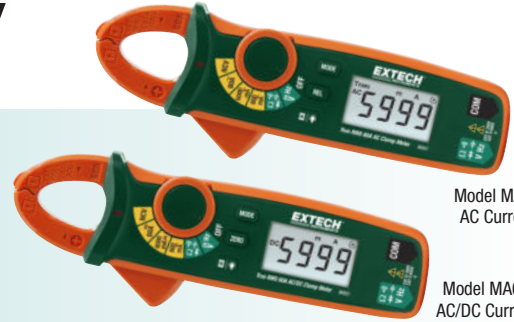
Model MA61 AC Current