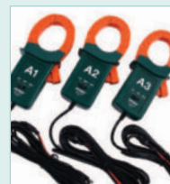
Model PQ34-12 1200A Current Clamp Probes with 2" (50mm) jaw opening