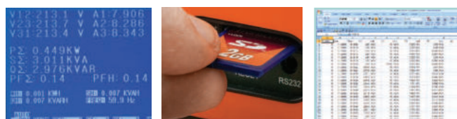
Backlit LCD displays numerical values. The data can be stored in SD memory card (included) and then transferred from meter to PC using Excel ® software and datalogged readings.

Complete with 4 voltage leads with alligator clips, 8 AA batteries, SD memory card, Universal AC adaptor (100 to 240V), and case. Clamp probes sold separately.