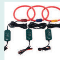
Model PQ34-30 3000A (24"/600mm) Flexible Current Clamp Probes for wrapping around busbars