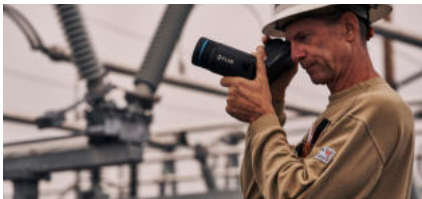
Assess the state of equipment from a safe distance, at any angle, or in any lighting condition