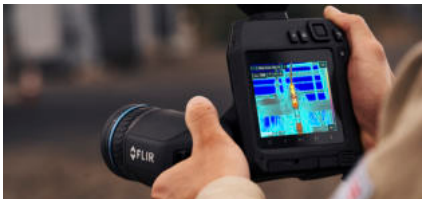
Collect and manage critical data quickly and easily