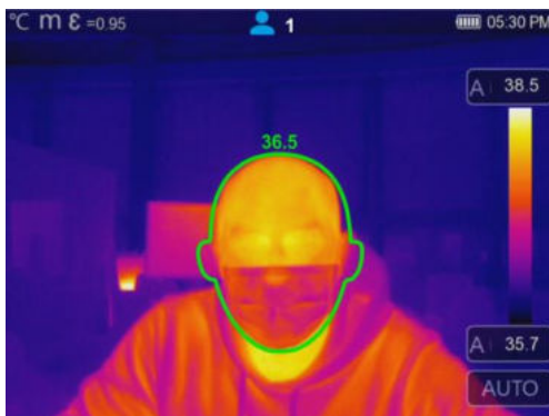
Screening function with Face Mode