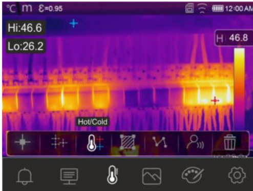
General menu with icons

The THT70n model is an advanced infrared camera with capacitive touch-screen TFT color display for quick and intuitive advanced use by any kind of thermograph operator