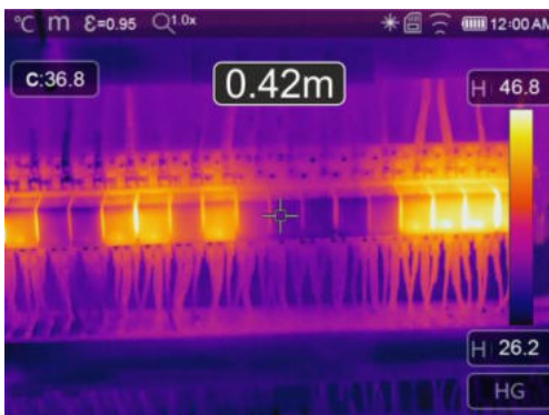
Distance measurement with laser pointer