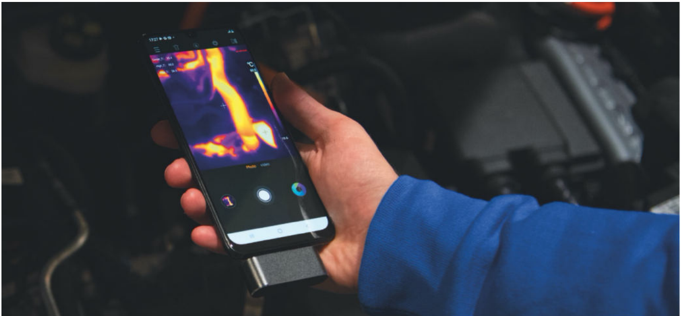
Connection of THT8 camera to a mobile device