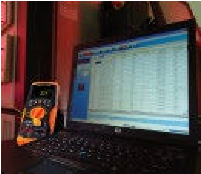
Figure 1. Automate recording of measurements with bundled GUI data-logging software.