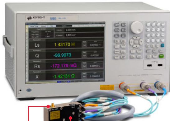
3.5 mm (female) test port

The Keysight E4982A LCR meter provides the best performance for the passive component manufacturing such as SMD inductors and EMI filters, where impedance testing at high frequencies is required. The E4982A is compatible to 4287A for Drop-in replacement.