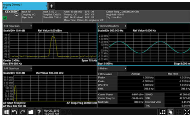
Figure 2. Analog demodulation