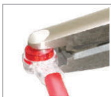
Crimping Tool Page. 82 (1PK-CT006/CP-148)