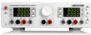
R&S®HM8143 three-channel arbitrary power supply