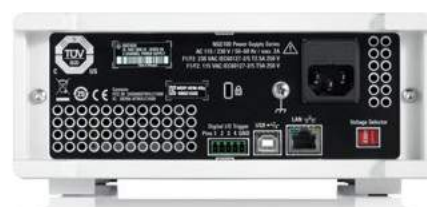
Rear view of the R&S®NGE100B series