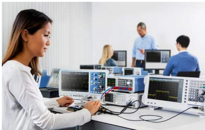
Tailored to be used in education, labs and system racks

Whatever might happen when unskilled students gain their first experience in practical work with electronics, all outputs of the R&S®NGE100B power supply series are short-circuit-proof and will therefore not be damaged.