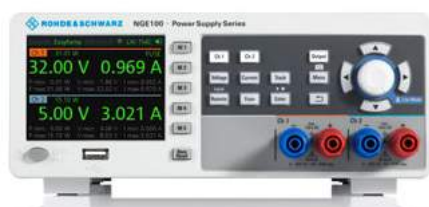
Front view of the R&S®NGE102B