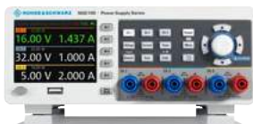
R&S®NGE103B three-channel power supply