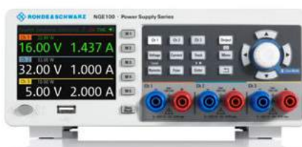
Front view of the R&S®NGE103B