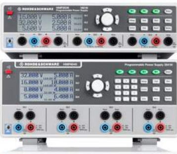
R&S®HMP2030 three-channel and R&S®HMP4040 four-channel power supply